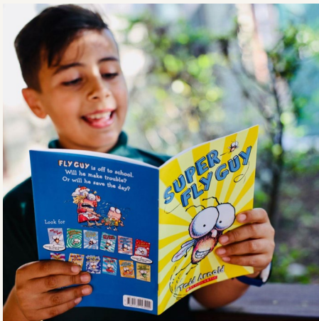
Image preview (only for visual purposes; use link above to download hi-res asset).