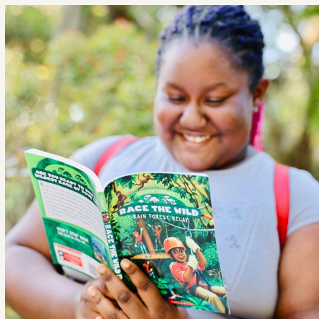
Image preview (only for visual purposes; use link above to download hi-res asset).